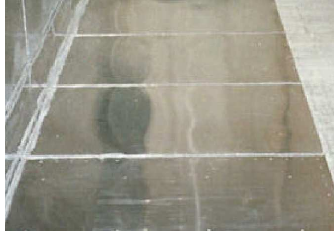
Aaronia Magnoshield® made from Mu-metal allows quick and easy large-area magnetic field screenings.

Installation is performed edge to edge to build a completely closed surface.